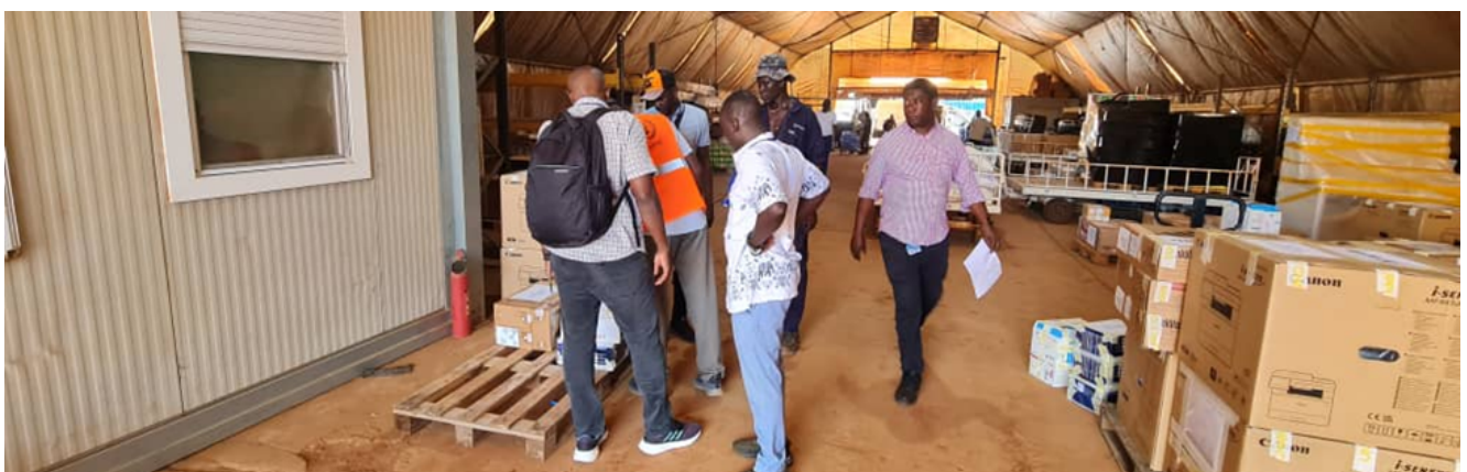
UNMISS Topping Logistics Base – Preparing to ship equipment to the States